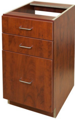
Base 3 drawer cabinet, top two drawers 6"