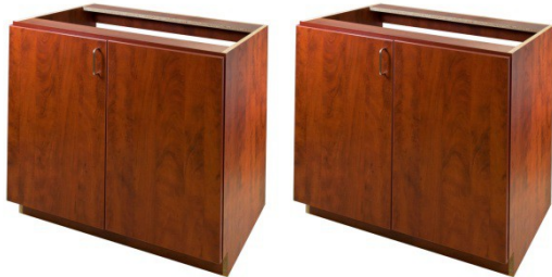
Left Hand Hinge