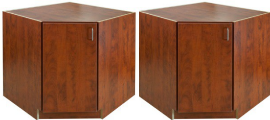
Left Hand Hinge