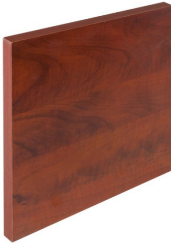
Melamine panel, edging on all edges