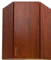
Right Hand Hinge

Single door wall cabinet with 45 degree door for corner application