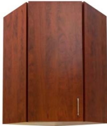
Left Hand Hinge