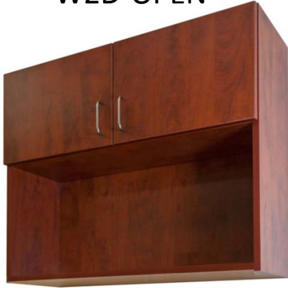
Double door wall cabinet with open shelf space